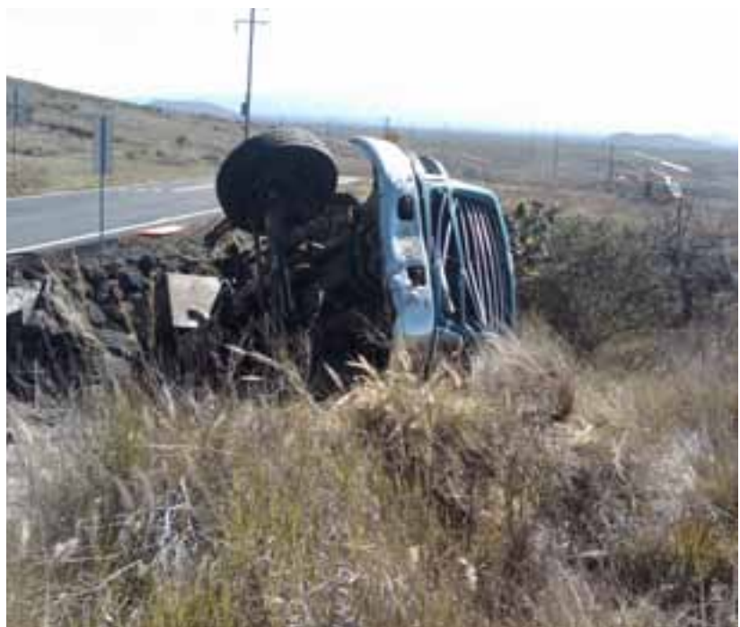
SADDLE ROAD, HAWAII COUNTY CRASH