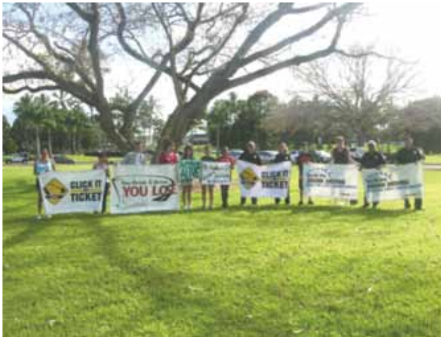
A COLLABORATIVE EFFORT . . . A SHARED RESPONSIBILITY

Reducing Traffic Deaths and Injuries from Impaired Driving is a Shared Responsibility.